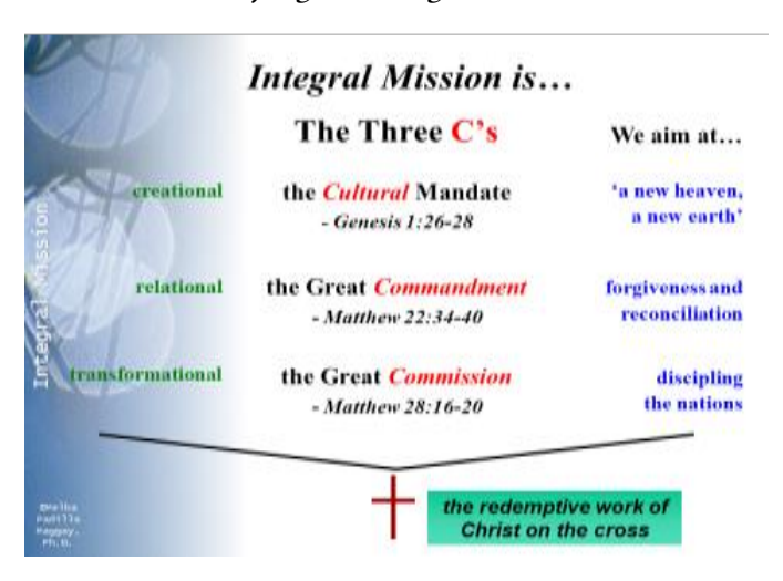
Figure 3 The Integral Mission

Maggay and Tink explained that the redemptive work of Christ on the cross is related to the integral mission , which includes The Three C's below:<sup>78</sup>