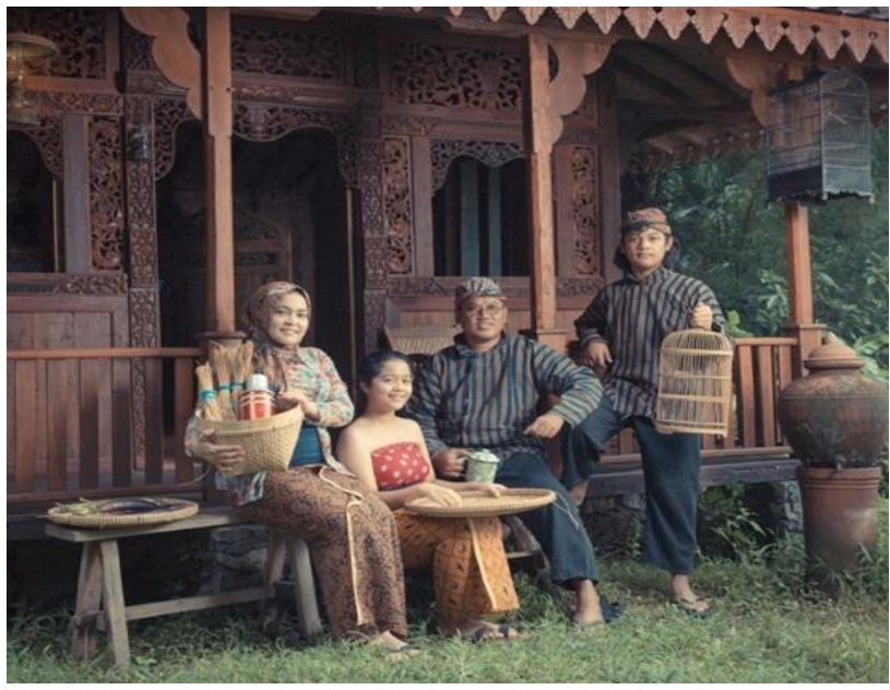
Figure 2 Javanese family in traditional clothes and traditional Javanese houses

mistakes in life. Waspada is defined as getting used to a simple life, not luxurious, trying to save, and being able to manage money (and other resources) properly. Eling and Waspada are intended as exercises for children, anticipating if in the future children would experience a difficult life, so the children can survive and succeed in the future.